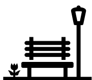
PARKS & TRAILS

Participants brought forward the following themes through conversations and online engagement tools.